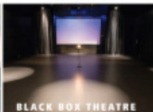
BLACK BOX THEATRE